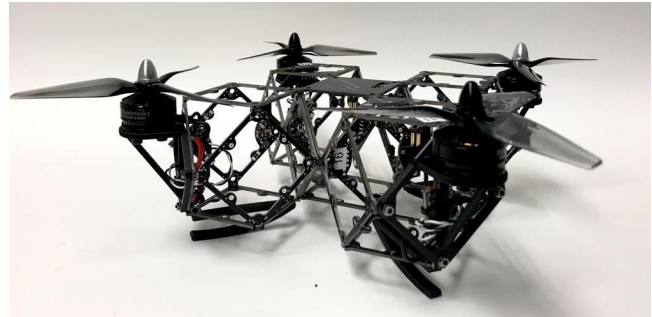
Figure 1: Complete UAS assembled using five voxels

either make compromises to system performance or invest in a new vehicle and design cycle, which is both costly and time intensive.